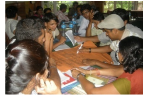
photo: group exercise